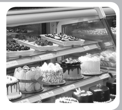
MARKETING: selling the food and finished products to you