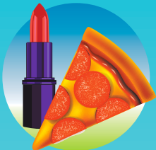
PEPPERONI & LIPSTICK