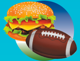
HAMBURGER & LEATHER