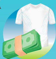
CLOTHING & MONEY