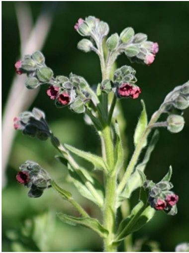
NRCS, Cynoglossum, Houndstongue, Columbus, MT 5/24/2007