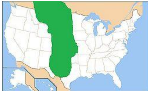
Map of the Great Plains [1]