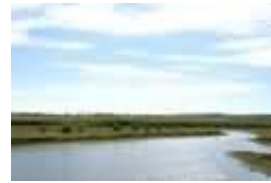
View of the Great Plains near the Missouri River of Montana

http://library.ndsu.edu/exhibits/text/gr eatplains/text.html