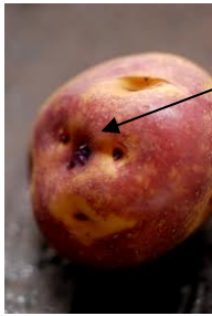
eye or bud

Note: If you leave a potato in a warm place for a few weeks you will see the new growth begin. Each section of potato with an eye will grow a new potato plant and form new potato tubers when planted.