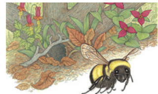
The Bumblebee Queen