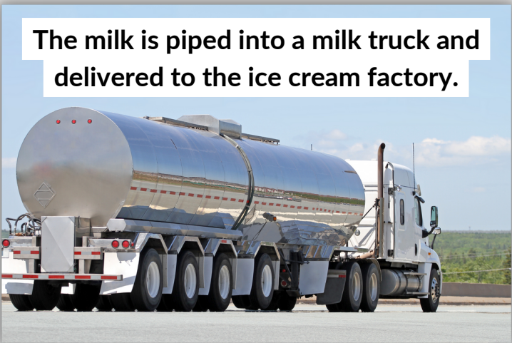
The milk is piped into a milk truck and delivered to the ice cream factory.