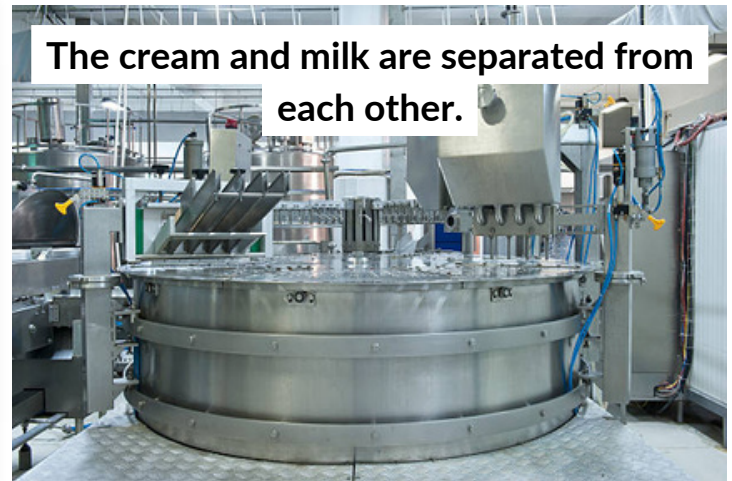
The cream and milk are separated from each other.