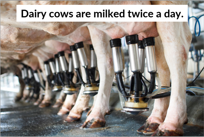
Dairy cows are milked twice a day.