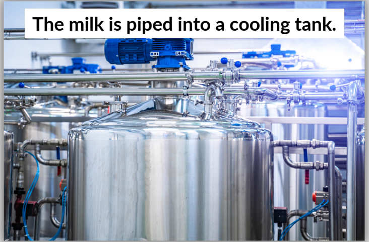
The milk is piped into a cooling tank.