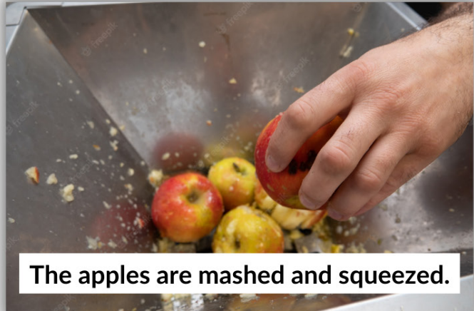
The apples are mashed and squeezed.