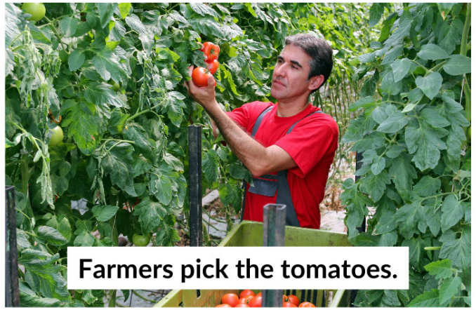
Farmers pick the tomatoes.