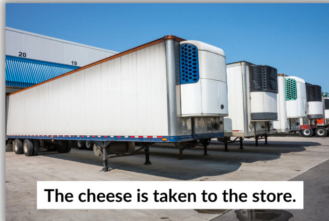
The cheese is taken to the store.