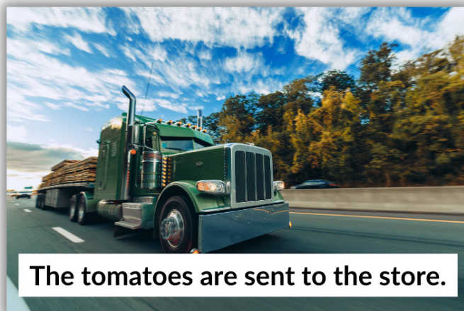
The tomatoes are sent to the store.