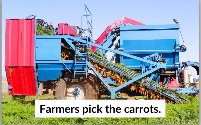
Farmers pick the carrots.