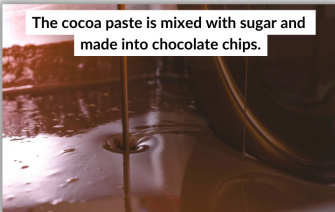
The cocoa paste is mixed with sugar and made into chocolate chips.