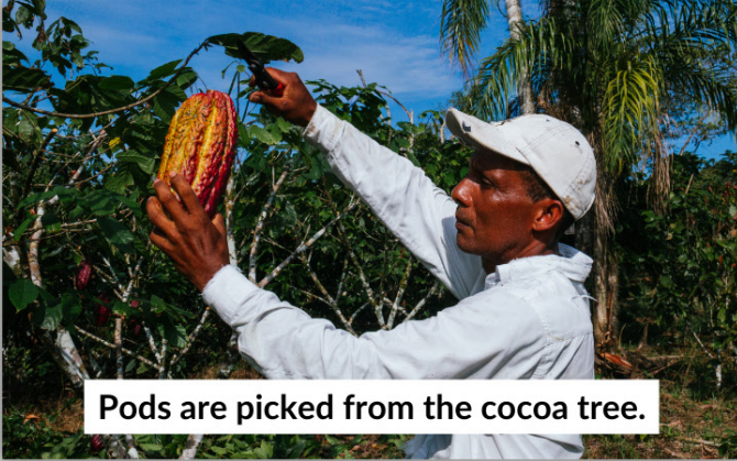
Pods are picked from the cocoa tree.