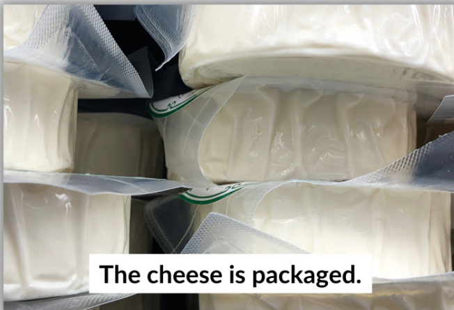
The cheese is packaged.