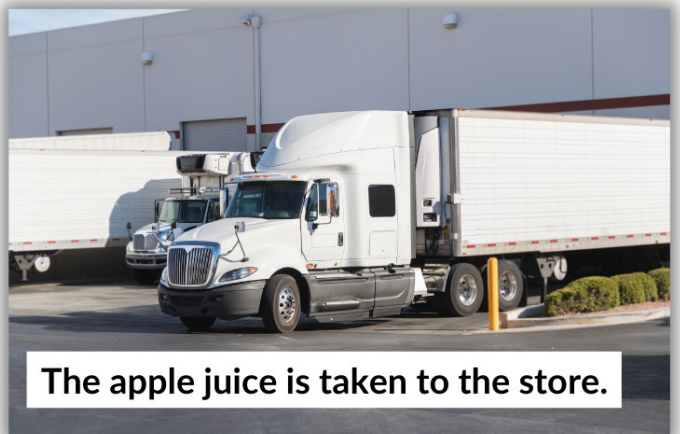
The apple juice is taken to the store.