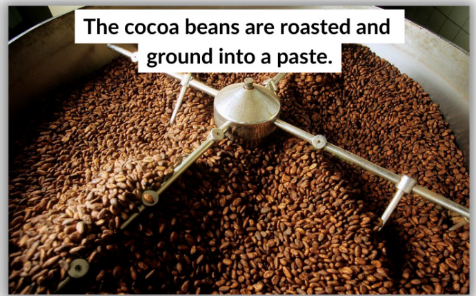
The cocoa beans are roasted and ground into a paste.