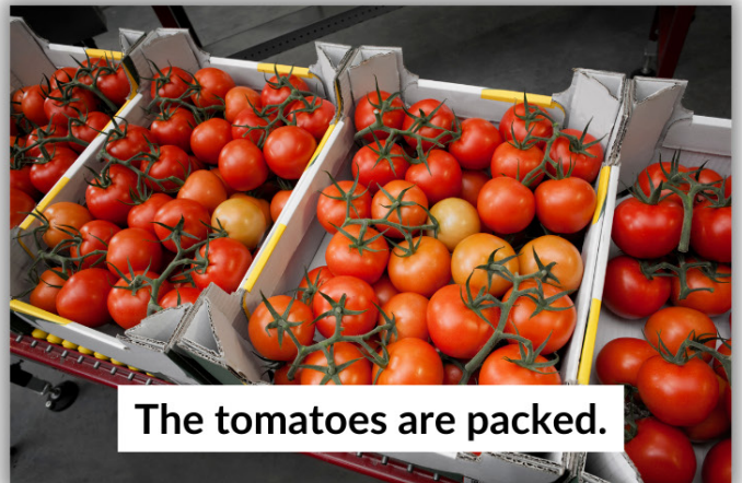
The tomatoes are packed.