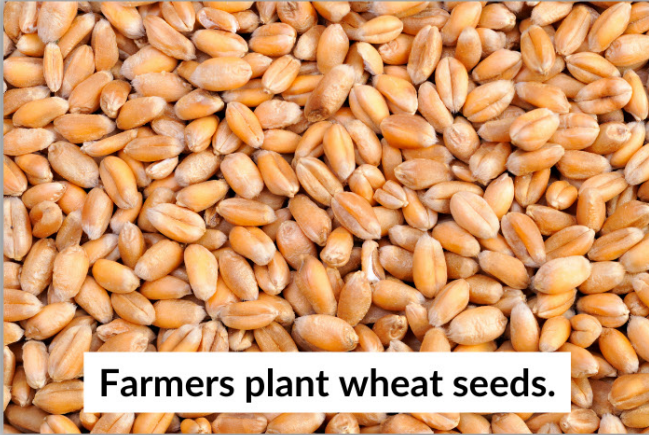
Farmers plant wheat seeds.