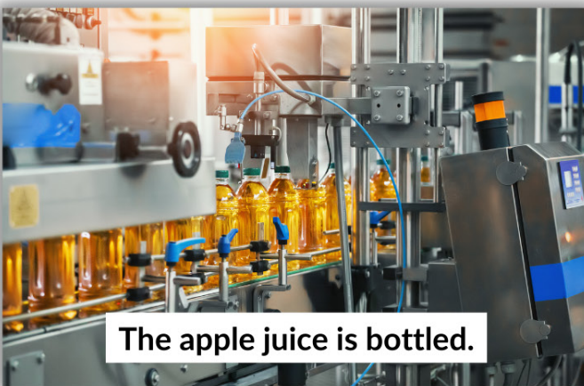
The apple juice is bottled.