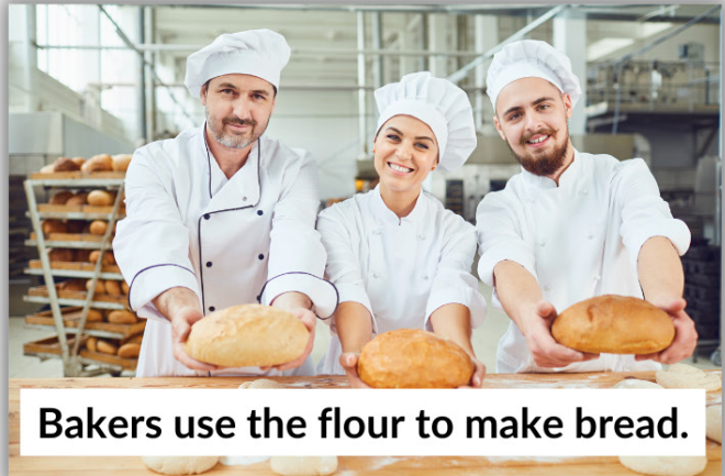
Bakers use the flour to make bread.