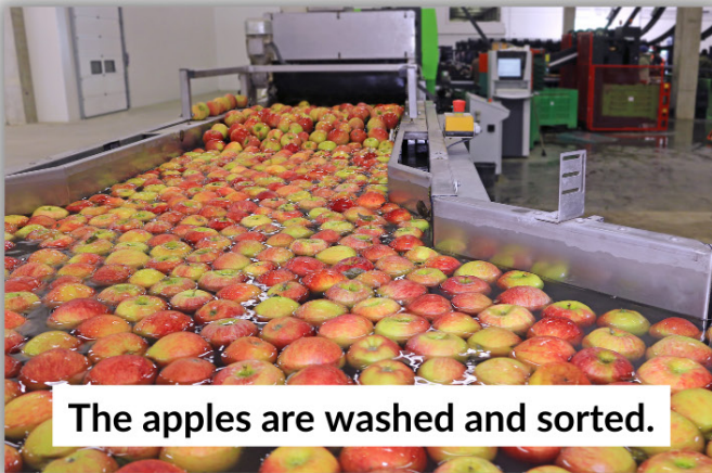
The apples are washed and sorted.