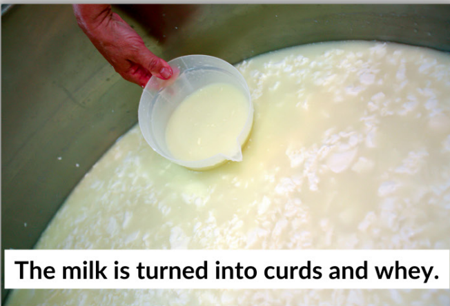
The milk is turned into curds and whey.