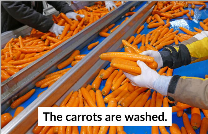
The carrots are washed.