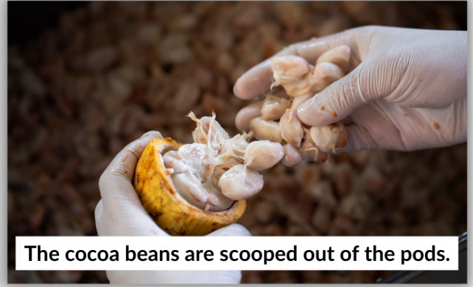
The cocoa beans are scooped out of the pods.