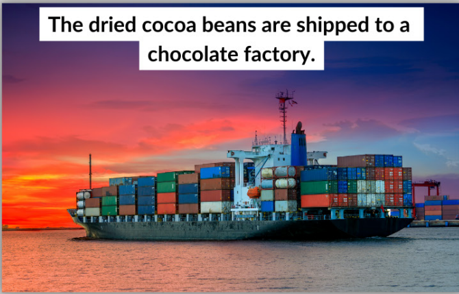
The dried cocoa beans are shipped to a chocolate factory.