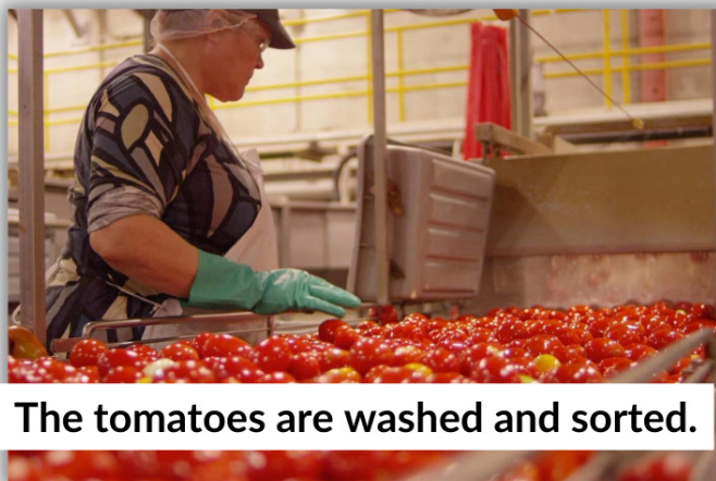
The tomatoes are washed and sorted.