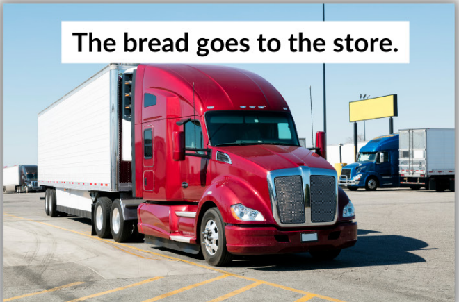
The bread goes to the store.