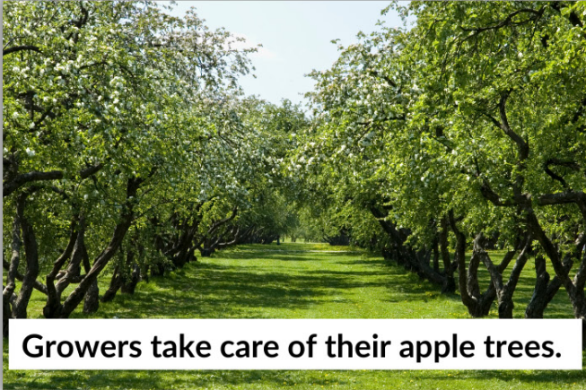
Growers take care of their apple trees.