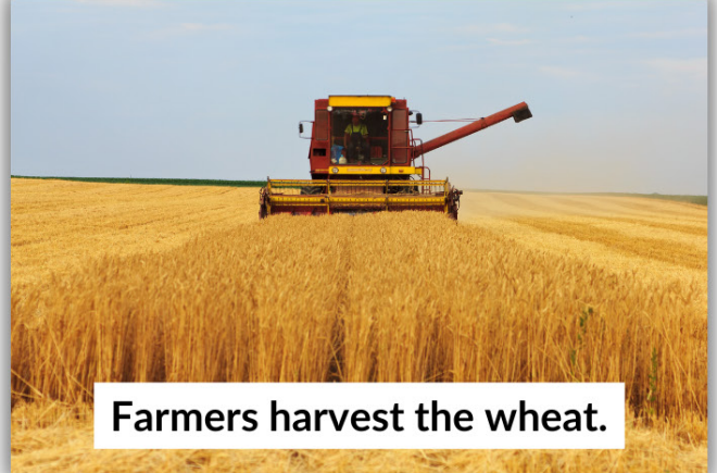
Farmers harvest the wheat.