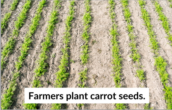
Farmers plant carrot seeds.