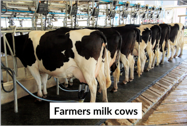
Farmers milk cows