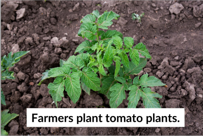
Farmers plant tomato plants.