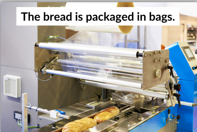
The bread is packaged in bags.