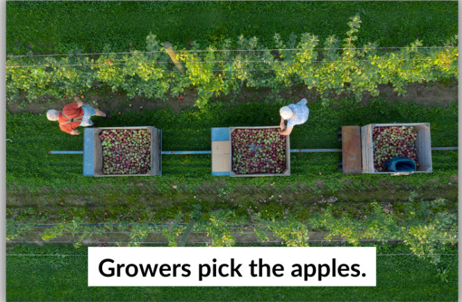
Growers pick the apples.