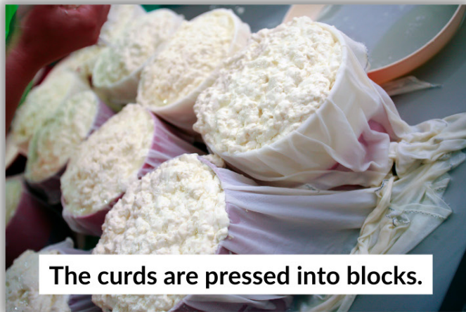
The curds are pressed into blocks.