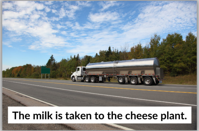
The milk is taken to the cheese plant.