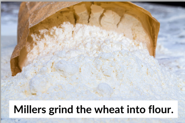
Millers grind the wheat into flour.