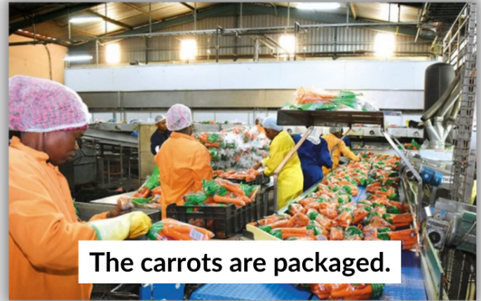
The carrots are packaged.