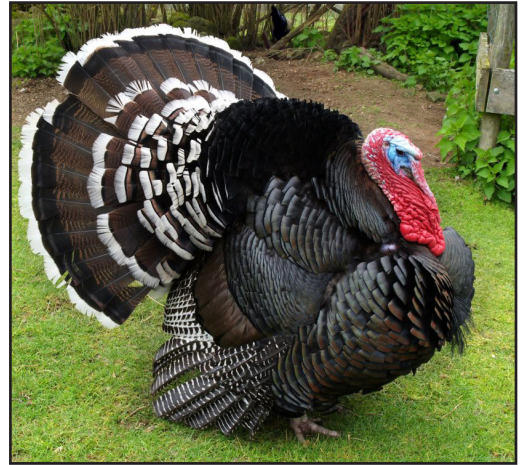
Standard Bronze Turkey

leave pigment spots under the skin when they are plucked. The White Breasted Tom is the result of many years of selective