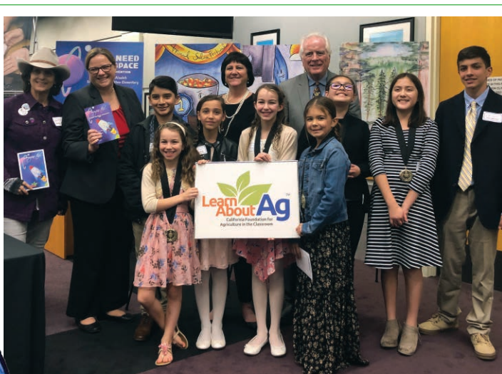
Imagine this... State Winners are honored with awards for their creative stories at Ag Day at the Capitol

Winning stories are illustrated by high school art students and published in the Imagine this... Stories Inspired by Agriculture book each year!