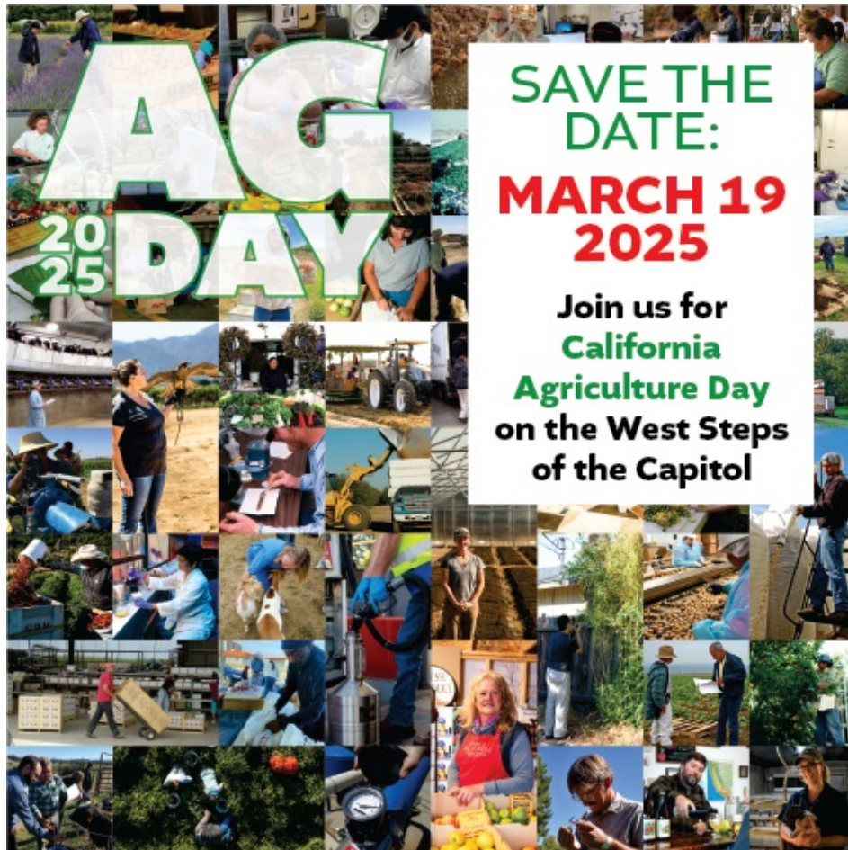
California Agriculture Day at the Capitol: March 19, 2025.

Ag Day is an annual celebration recognizing California's agricultural community by showcasing the bounty of crops and commodities produced in our state. It is also a day for farmers and ranchers to show their appreciation by bringing together state legislators, government leaders and the public for agricultural education.