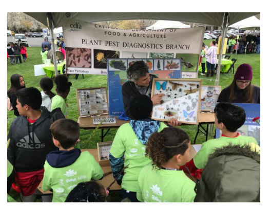
Students at our second annual Sacramento Farm Day learning about different pests.