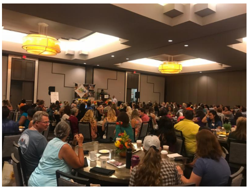
A picture from General Session at the 2018 AITC Conference in beautiful Palm Springs!