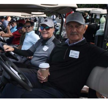
Golfers get ready to hit the greens at the Swing to Link golf event September 13 in Poppy