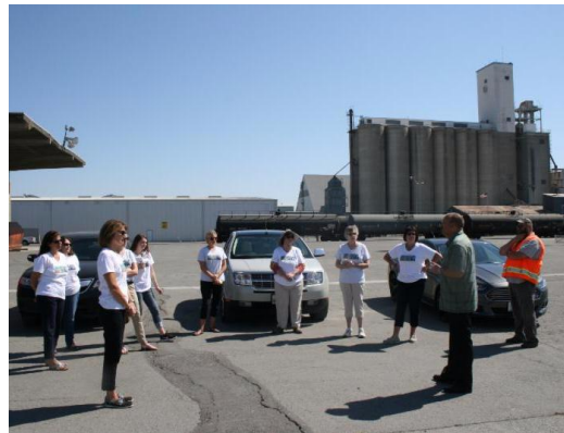
The "What's Growin' On?" Writing Team toured the West Sacramento Port to prepare to write the next edition... focusing on transportation!