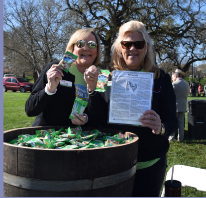
Zenith employees volunteered to help pass out snacks to students at Sacramento Farm Day.

We are so thankful for Zenith Insurance Company and all of our donors' continued support in providing great resources to California educators.