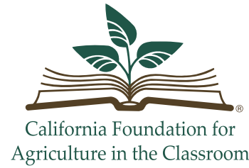
California Foundation for Agriculture in the Classroom

After 30+ years, we refreshed our look to attract even more teachers and families to our Foundation. We greeted 2018 by rolling out our new and improved logo. While our previous logo led us through great success since 1986, it was time for an update. Our new logo was developed with great thought and care and each of the three pieces has significant meaning relating to the work we do. We hope you enjoy!