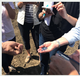
Writing team teachers learn planting techniques from a Yolo County farmer.