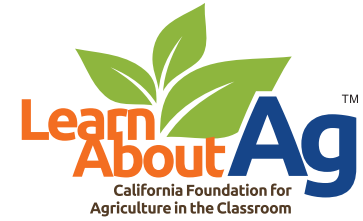
California Foundation for Agriculture in the Classroom

The sprouting leaves from our original logo have been revamped with a new modern look. Just as these leaves are thriving, we hope the students and teachers we reach are growing in their understanding of agriculture.