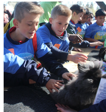
Students learned about the many different aspects of agriculture. Here students interact with a rabbit used for fiber production.