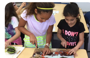
STUDENTS CUT UP AVOCADOS AND TOMATOES FOR THEIR MONTHLY TASTING OF FRESH PRODUCE.

At Raley's and Ag in the Classroom, we have seen that when you increase children's access to wholesome foods they are more likely to make better choices. We also