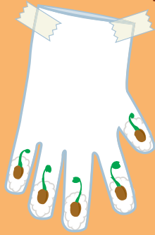
IMAGE FROM THE 'GARDEN IN A GLOVE' AG-BITE

Ag-Bites are bite-sized ways to bring agriculture into the classroom. These one-page sheets explain how to perform hands-on learning activities with students in various grade levels (K to 12). Aligned to standards and paired with several extension activities, teachers love this easy-to-implement resource.