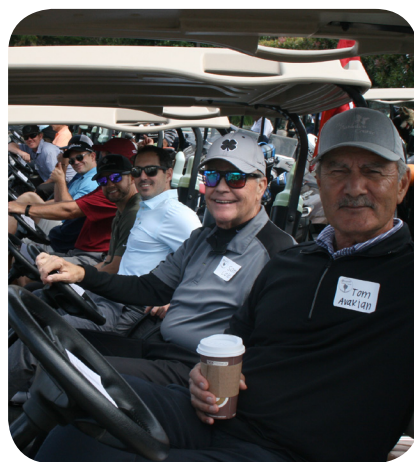
GOLFERS WAIT FOR THEIR TURN TO HIT THE GREEN