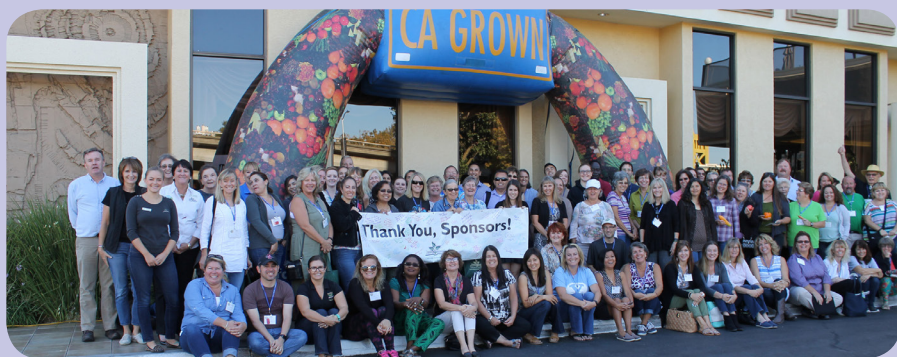
185 EDUCATORS THANK SPONSORS AT THE CALIFORNIA AGRICULTURE IN THE CLASSROOM CONFERENCE SEPTEMBER 22-24, 2016, IN SACRAMENTO.