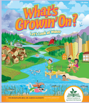
THE 13TH EDITION OF WHAT'S GROWIN' ON? FEATURES CRITICAL INFORMATION AND LESSONS ABOUT WATER ON EVERY PAGE.

The drought in California has caused all of us to think about water. Many students are not aware of the many ways they use water—from their homes, to their playgrounds, and to the food they eat. Recently, California Foundation for Agriculture in the Classroom partnered with California Farm Water coalition (CFCWC) to develop the 13th edition of What's Growin' On? – Let's Look at Water . In this educational newspaper, students will learn about the water cycle, how we get water, how we use it, and its importance to the environment and every aspect of our lives.