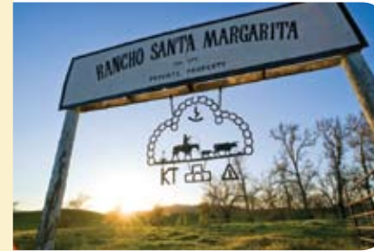
CONFERENCE PARTICIPANTS WILL ENJOY A BBQ AT RANCHO SANTA MARGARITA FOLLOWING A DAY-LONG TOUR OF SAN LUIS OBISPO COUNTY AGRICULTURE.

We strive to ensure that our attendees LEARN BY DOING—a skill they can share with their students in the classroom.