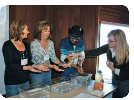
THE ANNUAL CALIFORNIA AITC CONFERENCE IS THE ONLY STATEWIDE FORUM OF ITS KIND, PROVIDING STIMULATING WAYS FOR EDUCATORS TO CONNECT STUDENTS WITH THE FOOD AND FIBER THEY USE EVERY DAY.

We invite all of our supporters to join us at the 2009 AITC Conference, taking place in Rohnert Park on October 23-24, 2009. See for yourself